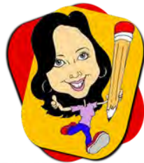
Big Head Cartoon Caricature Art Entertainment & Design